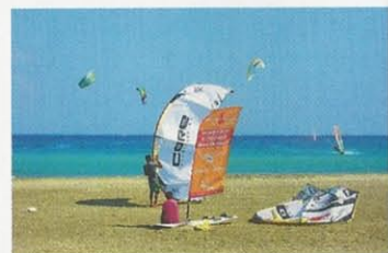
Ready to rip the flats

If the wind doesn't blow then there's SUP, yoga, beach volleyball, or slack-lining at the Pro Center, where there is also a bar that hosts movie nights on the beach. El Naaba also offers great snorkelling and diving.